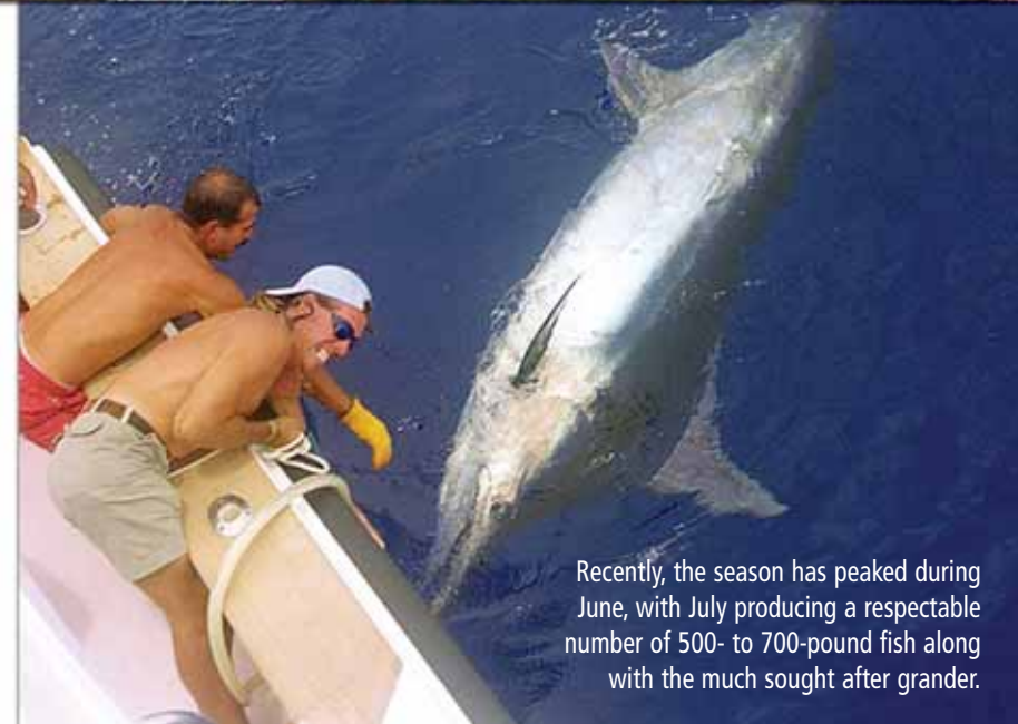
Recently, the season has peaked during June, with July producing a respectable number of 500- to 700-pound fish along with the much sought after grander.

With its excellent climate and breathtaking scenery, Madeira and the neighboring island of Porto Santo are the exposed peaks of a submerged mountain range, peeking up into the Atlantic Ocean. Needless to say, the island itself is mountainous. Due to the steepness of the mountain, the ocean reaches a depth of 6,500 feet a very short distance from