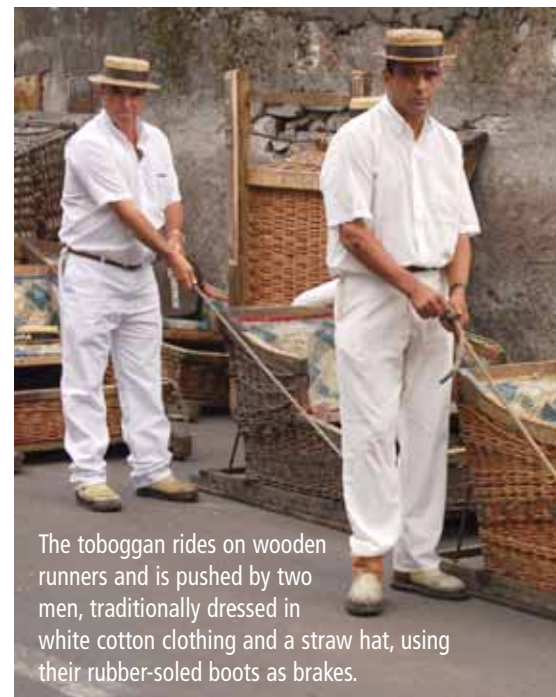
The toboggan rides on wooden runners and is pushed by two men, traditionally dressed in white cotton clothing and a straw hat, using their rubber-soled boots as brakes.

the earth flock to these fishing grounds each summer. Sea conditions are mostly calm as the northeast trade-winds blow during the summer, making a lee on the south side of the island. Avid anglers, royalty, and the famous all come seeking a grander. For some, the prospect for a new world record is enough to draw them. A few even bring their personal, well-equipped sport fishers across the Atlantic to meet the challenge.